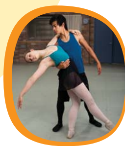
Far left: Dance Academy: Growing Pains Centre: My Place: 1958 - Michaelis Left: Dance Academy: Turning Points